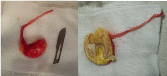
Figure 8. Removed oviduct, before and after opening (number 10 surgical blade for size comparison).

The patient recovered uneventfully from the anaesthesia and was sent home the very same day, medicated with enrofloxacin (10 mg/kg orally, q12h) and meloxicam (0,2 mg/kg orally, q24h). Unfortunately, the removed oviduct wasn't sent for histopathology and we weren't able to determine if there was any primary disease of the oviduct. However, the organ was opened and there were observed three altered egg remains (Fig8).