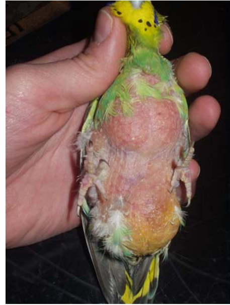
Figure 1. Patient on presentation

Physical examination revealed obesity (76 g body weight), extensive apteria over the chest and abdomen, inability to perch and severe abdominal distension. There was a yellow discoloration of the skin in the lower abdomen. It was possible to palpate a firm mass at the left region of the coelomic cavity. (Fig 1).