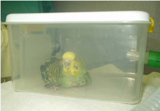
Figure 3. Patient in an adapted induction chamber. Maintenance of anaesthesia was made through facial mask. Heat was supplemented throughout the whole procedure with a heating pad. Skin and abdominal muscle were incised at the ventral midline and an impressively distended oviduct was readily seen (Fig 4).

Anaesthesia was induced with isoflurane, in an adapted induction chamber (Fig 3).