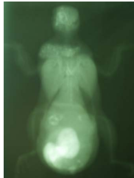
Figure 2. Ventro-dorsal full body x-ray

Patient was sent for X-ray that revealed the presence of three abnormally and highly calcified eggs (Fig 2).