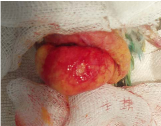
Figure 4. Distended oviduct, emerging from the abdominal incision.

Figure 3. Patient in an adapted induction chamber. Maintenance of anaesthesia was made through facial mask. Heat was supplemented throughout the whole procedure with a heating pad. Skin and abdominal muscle were incised at the ventral midline and an impressively distended oviduct was readily seen (Fig 4).