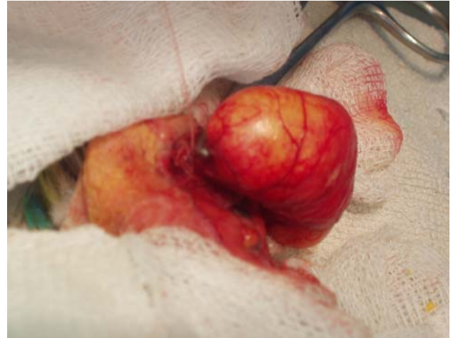
Figure 5. Clamping and ligation of the oviduct at its distal portion.

For ease of surgical procedure, and because of the extreme dilation of the lower oviduct, removal of this organ was started at its most distal portion (Fig 5).